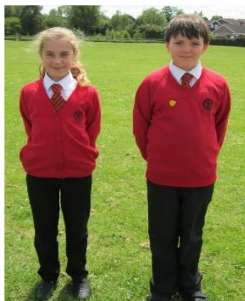
KS2 (Years 5 & 6)

Parents are free to buy from other outlets, provided the items comply with those available from our recommended supplier. The school reserves the right to reject non-specification items of uniform. For this reason, we recommend that school uniform suppliers are used, rather than fashion clothing outlets.