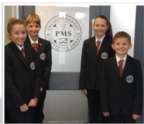
KS3 (Years 7 & 8)